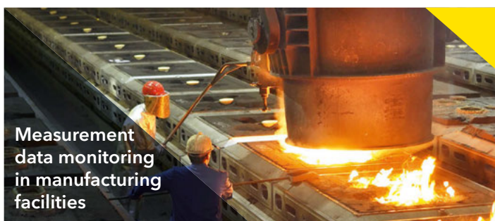
Measurement data monitoring in manufacturing facilities