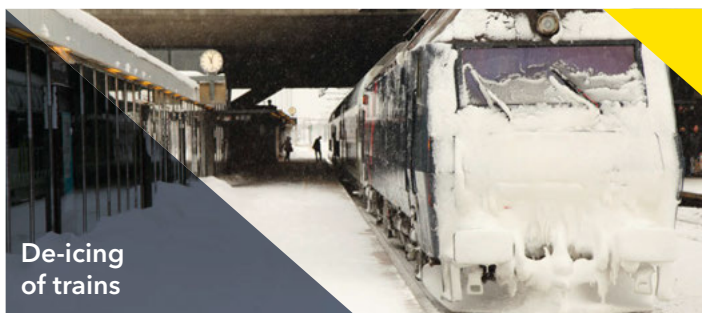
De-icing of trains