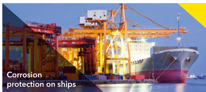
Corrosion protection on ships